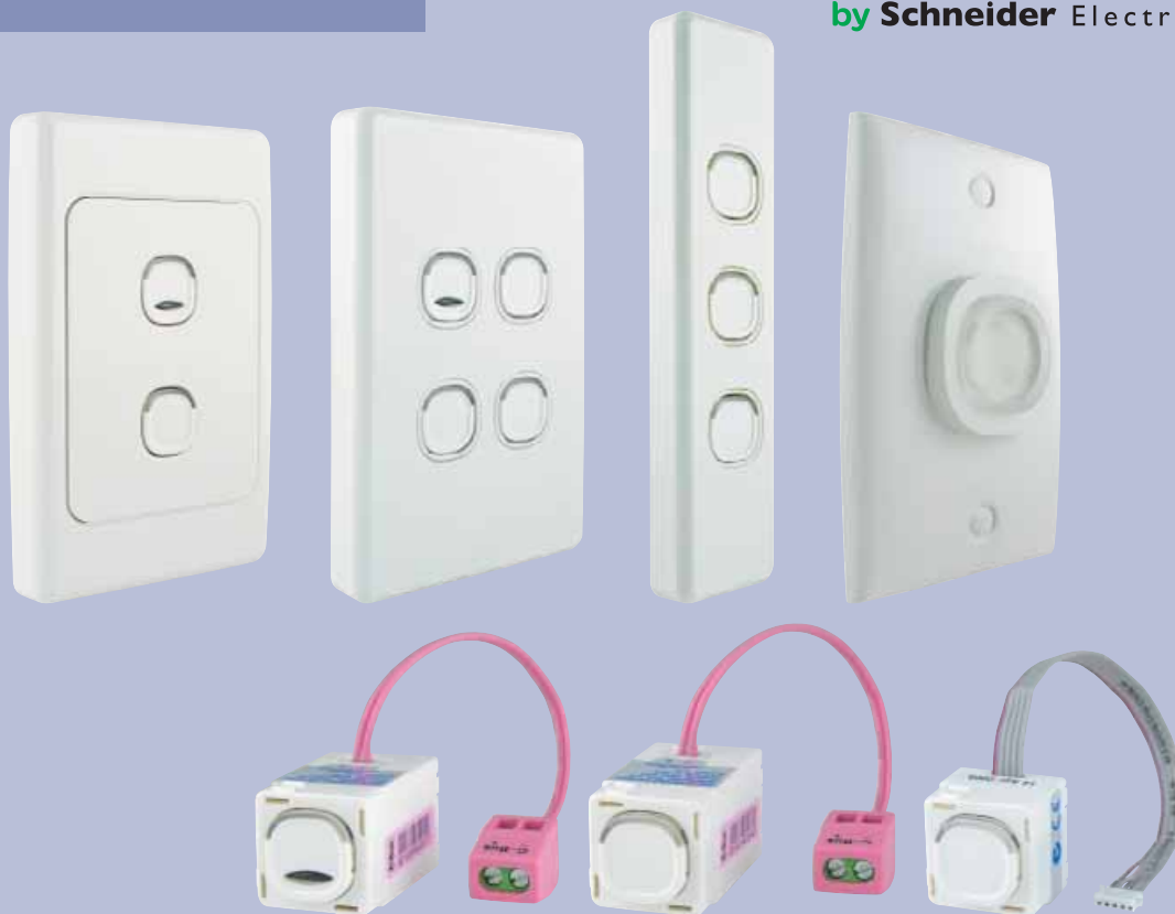
C-Bus® 30 Mechanism

The C-Bus 30 Mechanism (30mech) offers the ability to install C-Bus in any style of switchplate, grid or enclosure that currently accommodates Clipsal 30 series mechanisms. Previously, all standard plastic or metal C-Bus switchplates had to be purchased as complete 1, 2 or 4 button units.