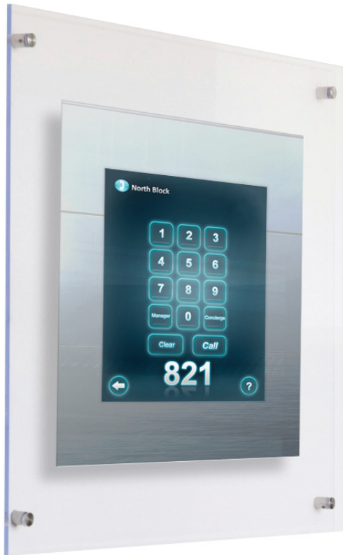
Intercom Screen, Front View

The Touch IP Intercom Door Station allows 2-way communication via a SIP compatible IP PBX switch to IP Phones, Soft Phones, Mobile Phones (via GSM gateway), and Touch Interfaces.